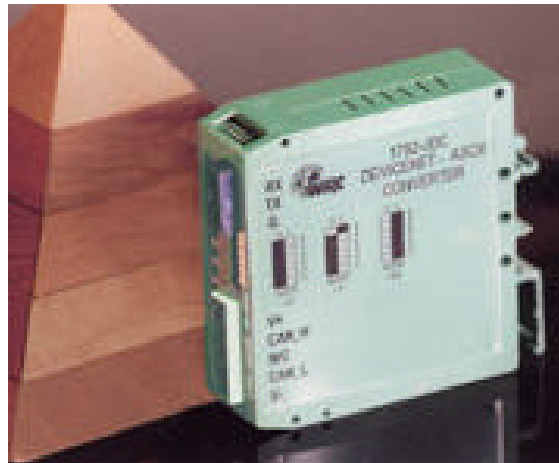
Figure 1-1 1782-JDC

This manual applies to 1782-JDC version 5.01.